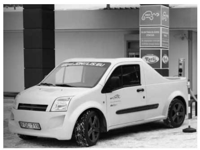
Fig. 1. Charging point at Brivibas street 299, Riga [9]

The first public charging point in Latvia was opened in October, 2010, at the petrol station "Kursi", Brivibas street 299, shown in Figure 1 [9]. It was developed by the local producer "Eltus" [10].