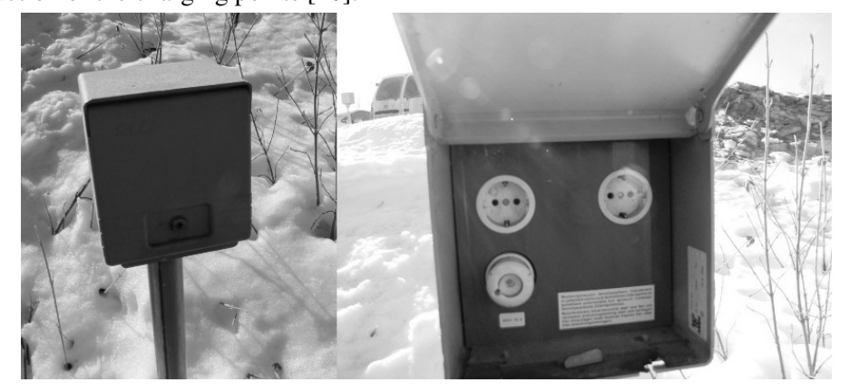
Fig. 5. Sockets for engine heating in town Nokia, Finland

The project launched electric charging point prototype and test unit development for electric and plug-in hybrid electric cars. After finishing the pilot project in 2011, the manufacturer is now starting serial production of the charging points [10].