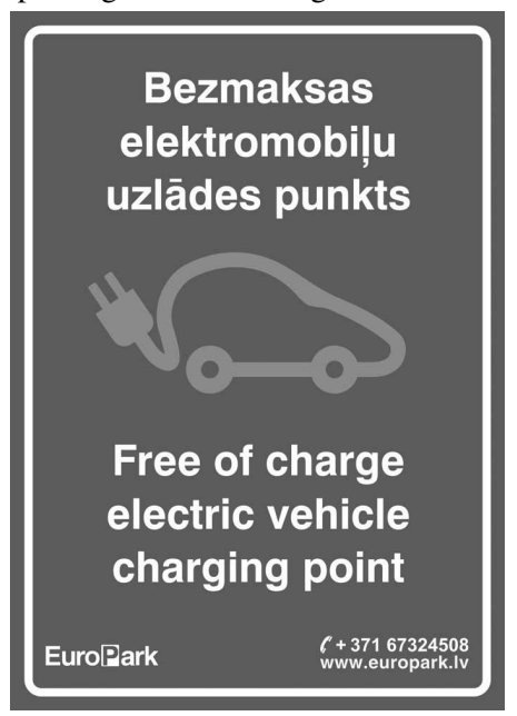
Fig. 2. Marking of charging point at Europark parking [11]

Currently, there are no agreements for unified marking of the charging points in Latvia. An example of marking at Europark parking is shown in Figure 2.